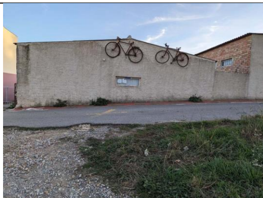
On the way to stage 6