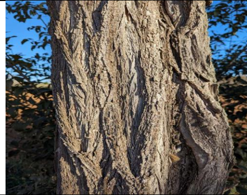
Sweet white flowered acacia tree

Stage 4b Corner - where Juscafesca, the railway, road, and fields meet. 'Trees': Bamboo