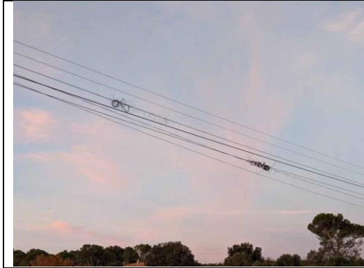
Stage 4a looking up at the telegraph wires

Stage 4a Passing. By the tree: White flowered acacia