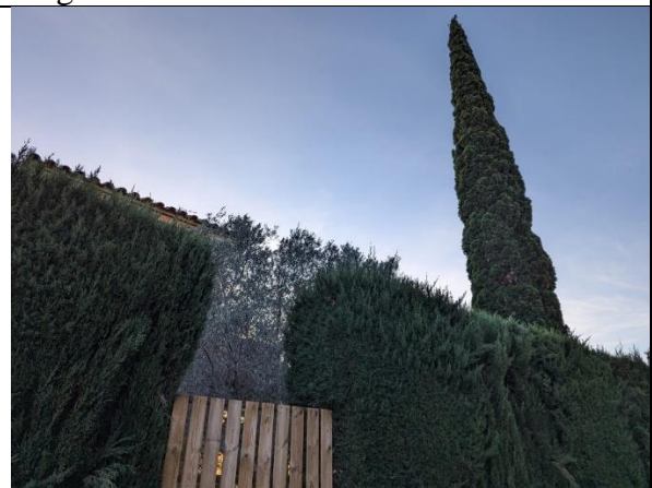
Cedar tree / hedge

© This Camallera Sound Walk was created by Tamsin Grainger with the support of Nau Còclea, November 2023