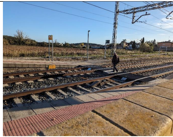
Pedestrian crossing – Be careful!

Stage 2 Listen to the water - Recreation area. Tree: 5 poplars