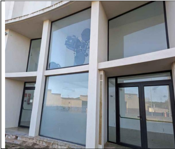
The disused cinema