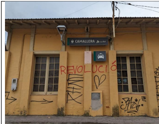
Stage 1, the station

Stage 1 Arriving - Train station (Estacion de tren). Tree: Peruvian peppertree