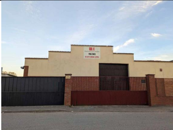
Metal-lúrgica de Camallera