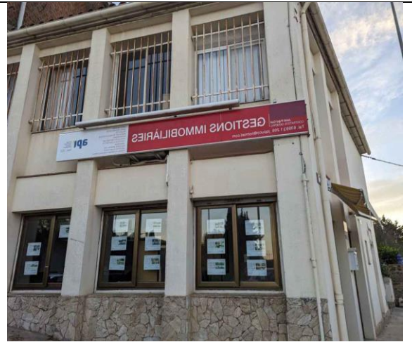
Estate agents to the left of the cinema