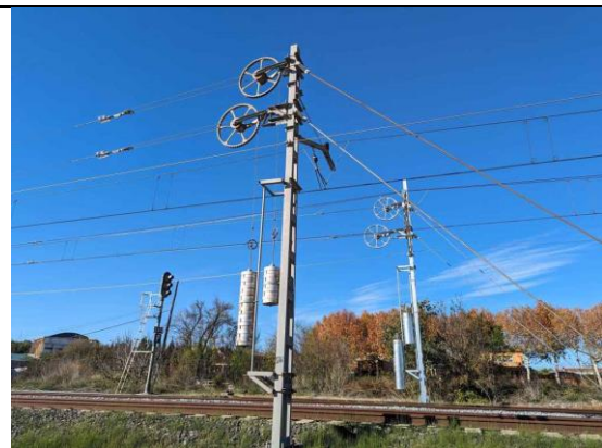
The railway is also behind you

© This Camallera Sound Walk was created by Tamsin Grainger with the support of Nau Côclea, November 2023