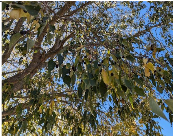
Hackberry ( buletta ) tree

© This Camallera Sound Walk was created by Tamsin Grainger with the support of Nau Côlea, November 2023