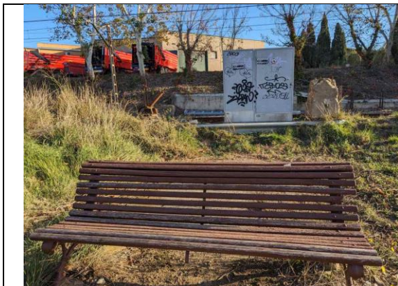
Have a seat and listen to the noises of the Juscafresca factory behind you

Stage 4b Corner - where Juscafesca, the railway, road, and fields meet. 'Trees': Bamboo