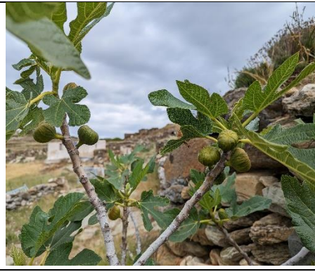
Stage 10 Play - Play park (Parc d'Infantil). Tree: Hackberry ( buletta tree)