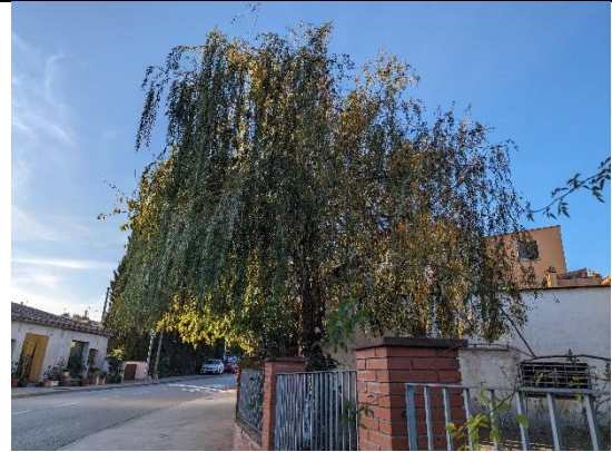
One of two Willow trees