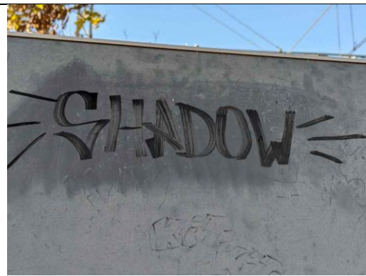
Look out for 1 of the shadows!

© This Camallera Sound Walk was created by Tamsin Grainger with the support of Nau Còclea, November 2023